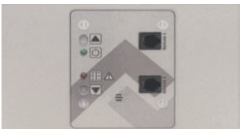
Clearly structured control panel