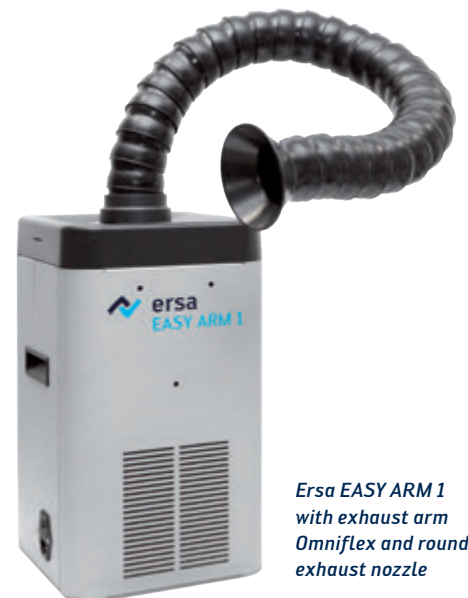
Ersa EASY ARM 1 with exhaust arm Omniflex and round exhaust nozzle

For energy saving purposes and to extend filter lifetime, both units can be connected with Ersa i-CON soldering stations or a standby switch. In this way, the extraction unit is only working whilst the attached soldering station is in operation, stopping as soon as the soldering station goes into standby mode.