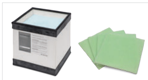
High-end filter materials, same filters for EASY ARM 1 and EASY ARM 2